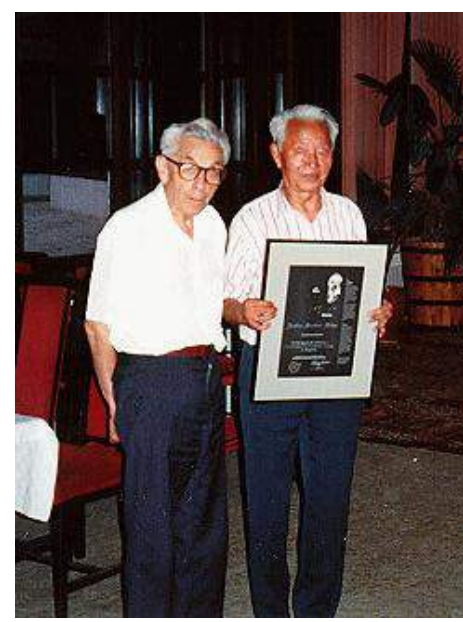
Figure 3: Sanjmyatav Urjintseren recieving the Paul Erdos Award, 1994.

One of the first generation algebraists, Sanjmyatav Urjintseren (1926–2003), was a key figure in the Olympiad movement, and he acted as the chairman of the national Olympiad committee for 17 years. In 1994 he received the Paul Erdős Award for playing a significant role in the development of mathematical challenges at the national or international level and being a stimulus for the enrichment of mathematics