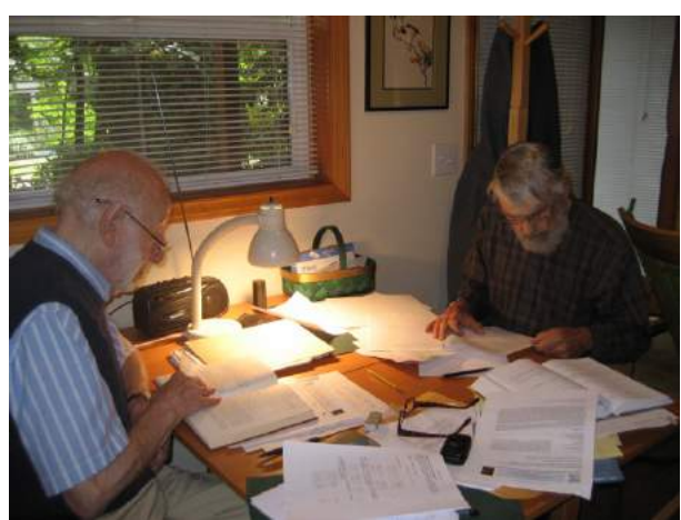
Ingram and Al at work in Seattle, August 2015

And so began their legendary, 58-year collaboration. First and foremost must be noted their landmark treatise on majorization [4], in which they show how many, if not most, classical inequalities, such as the arithmetic mean/geometric-mean inequality, Hadamard's inequality for the determinant of a positive definite matrix, isoperimetric inequalities for convex polygons, and entropy inequalities, all arise in the unified framework of majorization. Their statistical applications of majorization included the unbiasedness and power of multivariate hypothesis monotonicity concentration inequalities for sums of independent random variables, and bounds for the probability of correct selection of the largest cell probability in a multinomial distribution or the largest population mean based on a sample from independent univariate distributions. We estimate that over three thousand papers citing the first and second editions of [4] have subsequently appeared.